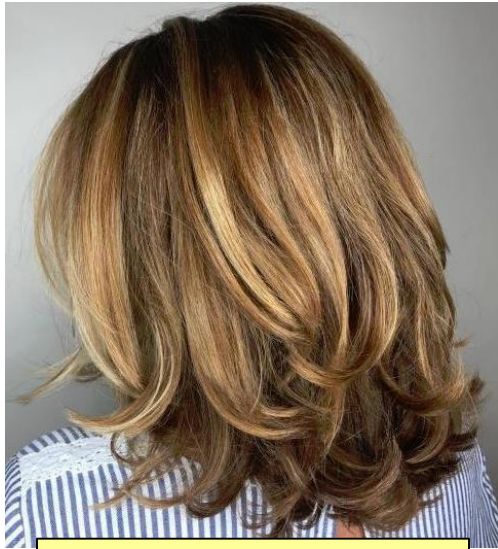
inspiration for 3/7/24 hair appt: warmer vs cooler tones